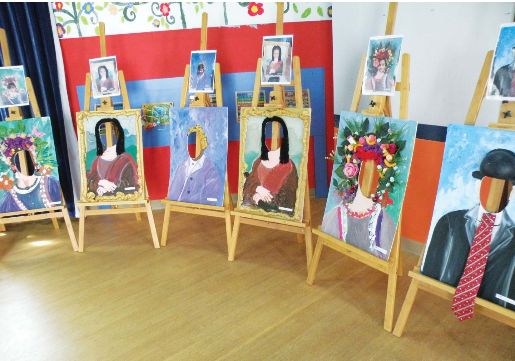
ART EXHIBITION AT ISAS