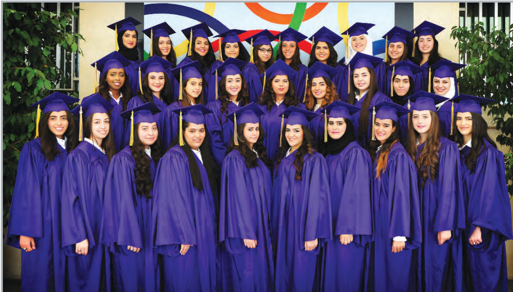
Grade 12C - Al Garhoud