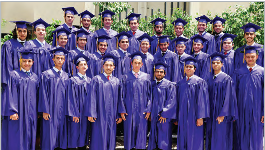
Grade 12B - Al Garhoud