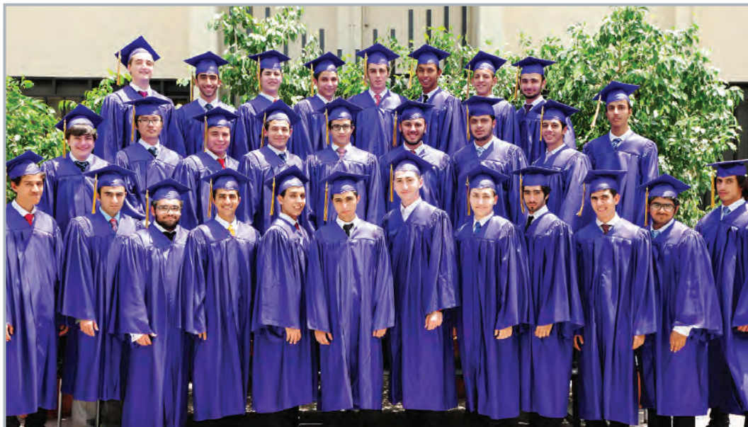
Grade 12D - Al Garhoud