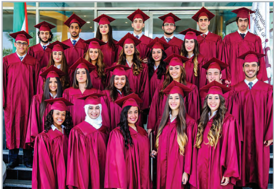
Grade 12B - ISAS