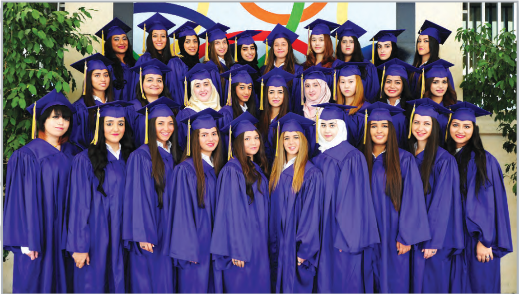
Grade 12A - Al Garhoud