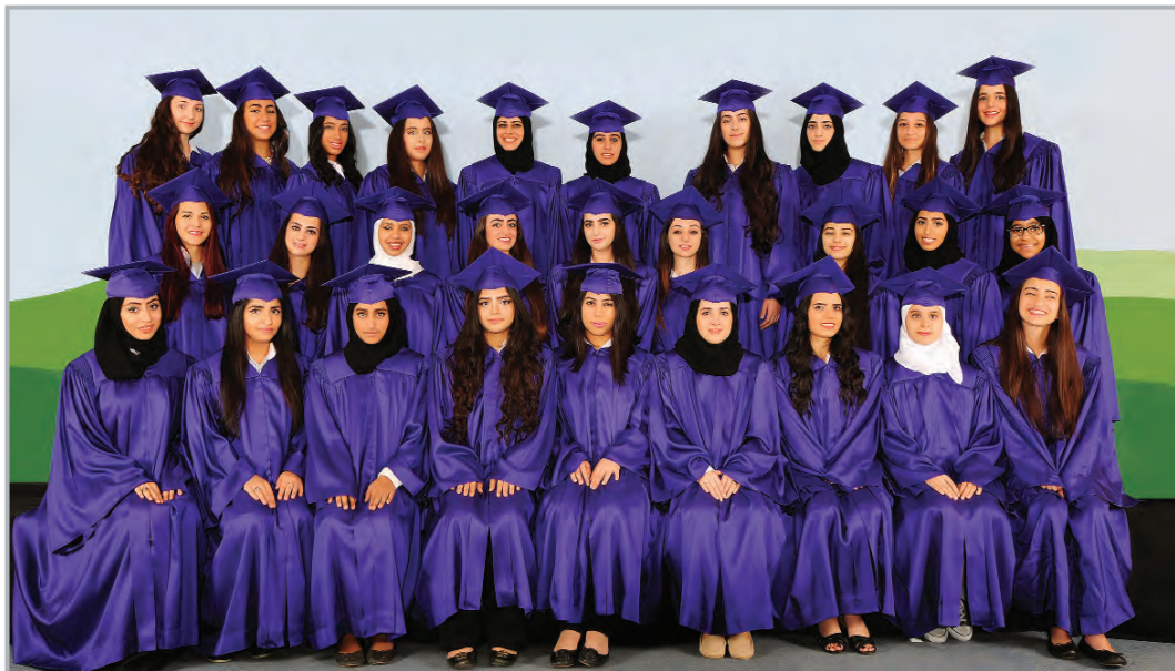
Grade 12F - Al Barsha