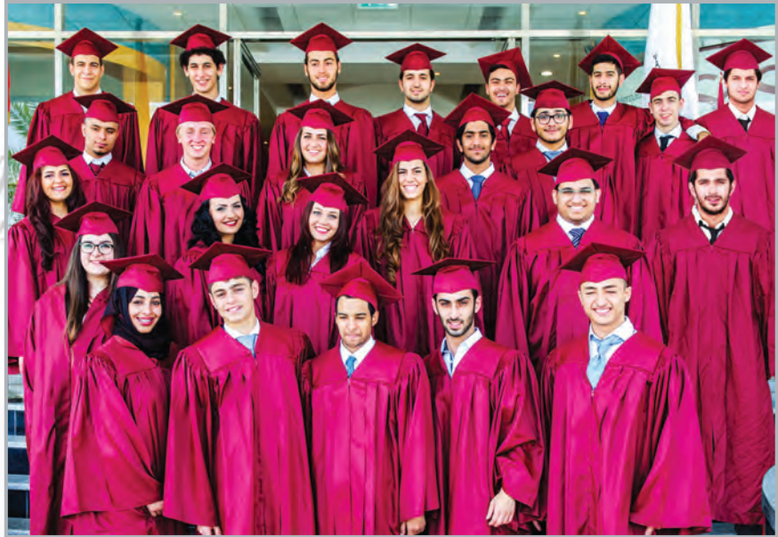
Grade 12A - ISAS