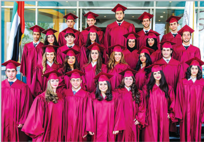
Grade 12D - ISAS