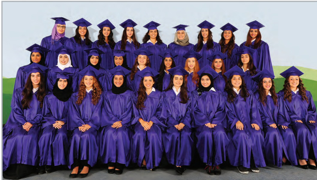
Grade 12C - Al Barsha