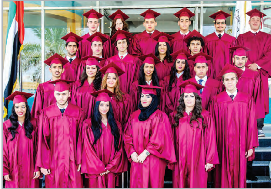
Grade 12C - ISAS