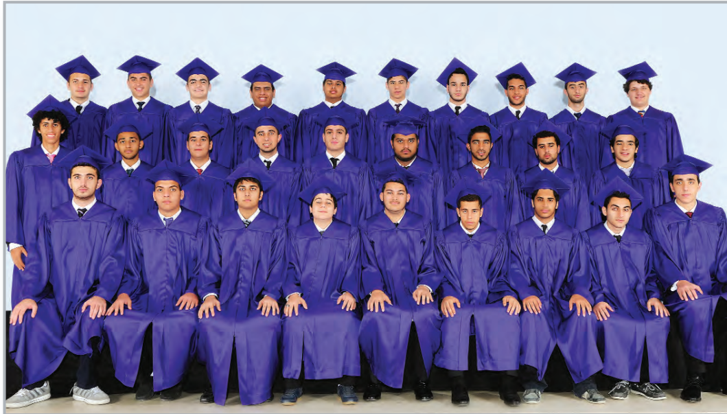
Grade 12B - Al Barsha