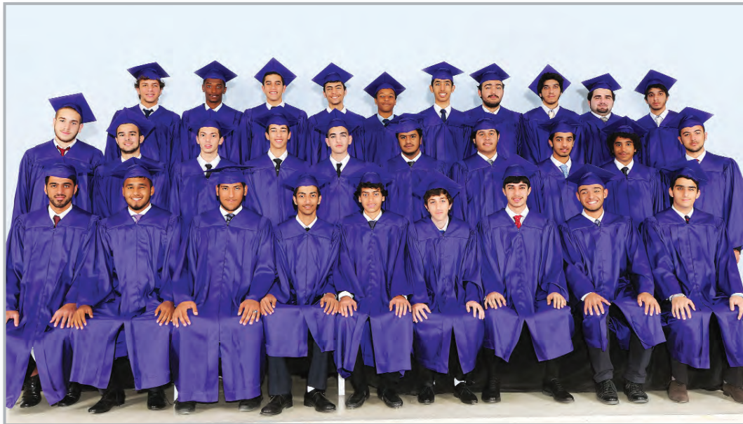
Grade 12E - Al Barsha