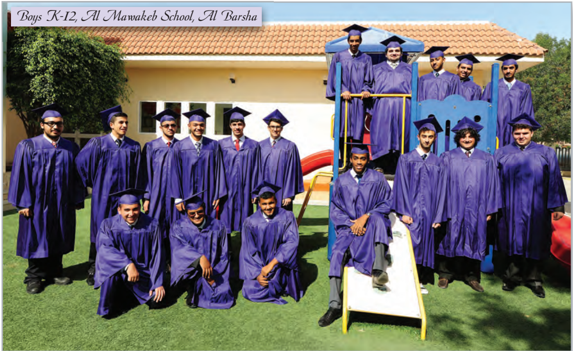
Boys K-12, Al Mawakeb School, Al Barsha

فطوبى لكم أيها الأحبّة البررة، لقد اختار لكم ذوكم المواكب بيتًا ثانيًا تنهلون منه رحيق العلم والمعرفة؛ فسببتم فيه واستمرّتم - لأربعة عشر عامًا - بفعل الثقة.. وبفعل الإرادة؛ وها أنتم تغادرونه اليوم أقوياء بما تعرفون، تبسّم لكم الحياة وينتظركم الغد.. طوبى لكم فلقد أحسنتم اختيار البعد الثالث.