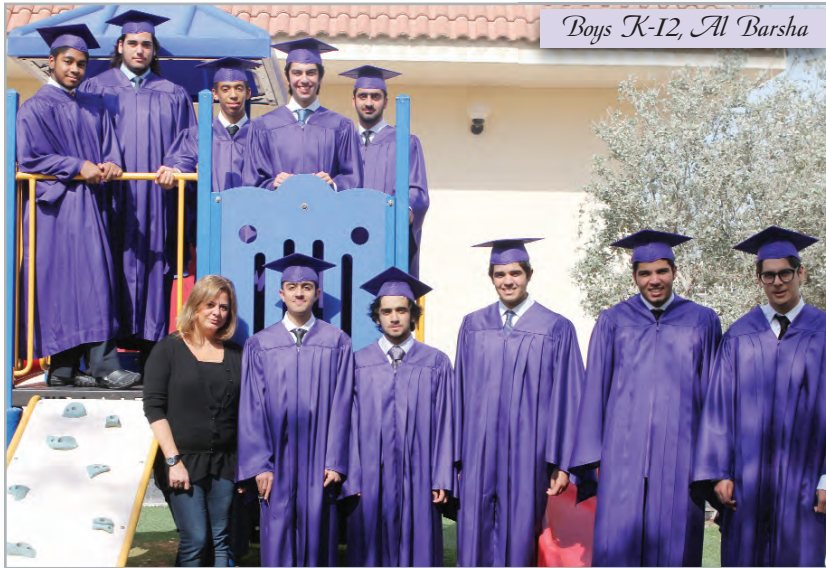
Boys K-12, Al Barsha

يُسالُ الطلاب في أصقاع الأرض عن مدارسهم التي تلقوا فيها علمهم فيكون جوابهم درسنا في المدرسة الفلانية والمدرسة الفلانية ويعددون أسماء ثلاث مدارس فأكثر، ونُسال فنجيب في المواقب ليس مجرد اسم وليست مجرد مدرسة إنها حياة... حياة كاملة ولا نبالغ عندما نقول بأننا بعمر جدران هذه المدرسة، فقد شاءت الأقدار أن نكون أول طلاب يرتادون هذه المدرسة عشنا الأيام فيها بطوها ومرّها اختلط الحزن بالفرح واليأس بالأمل. كنا عائلة صغيرة وكبرت هذه العائلة شيئاً فشيئاً ولكلِّ منّا أكثر من أبٍ وأكثر من أم... فأُمُّ في المنزل وأمهات مربيات فاضلات في المواقب... وأبٌّ وأخٌّ في المنزل وآباء محبون وأخوة مخلصون في المواقب. أدركنا كُنْه الحياة داخل هذه الأسوار وكنا أشبه بغراسٍ زُرعت وها هي الآن قد نمت وغدت أشجاراً وثمارها أينعت وأتت أكلها، فبِأبنا مدرستي وبِأعشقي لن نخيب أملك بما علّمت وسنكون إن شاء الله مبعث فخرٍ لك .