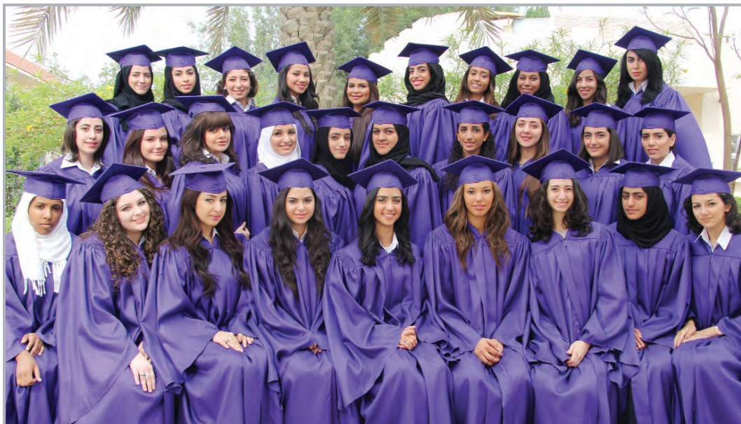
Grade 12F - Al Barsha