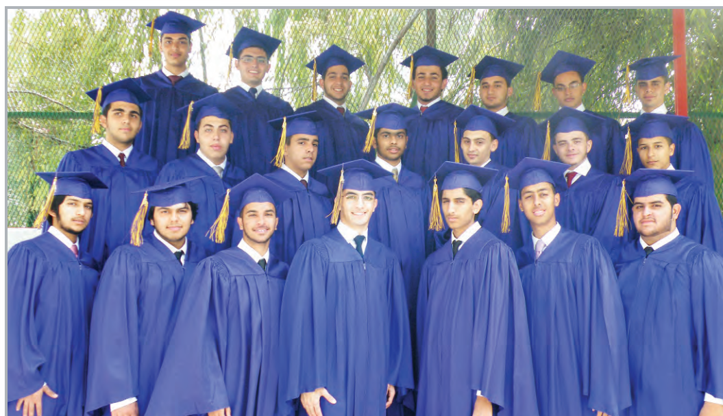
Grade 12D -Al Garhoud