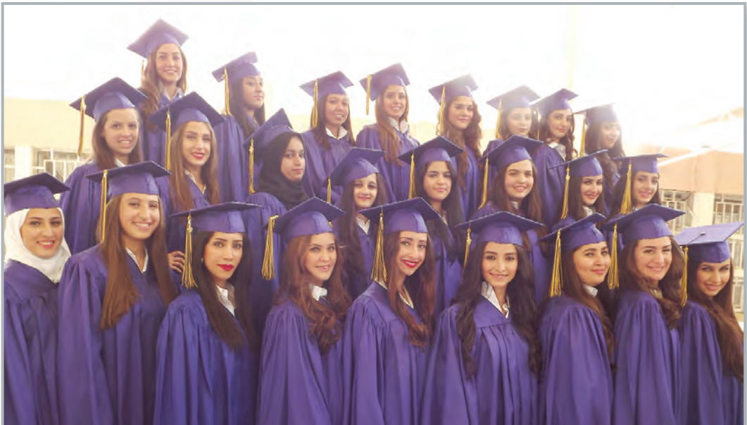
Grade 12F - Al Garhoud