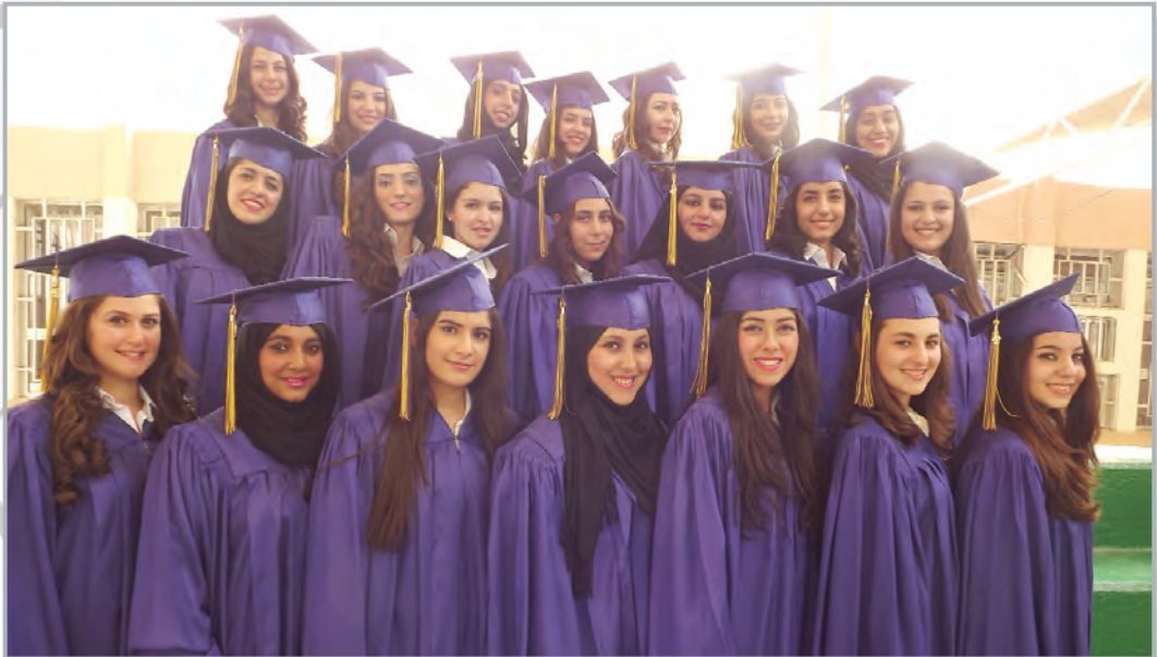
Grade 12A - Al Garhoud