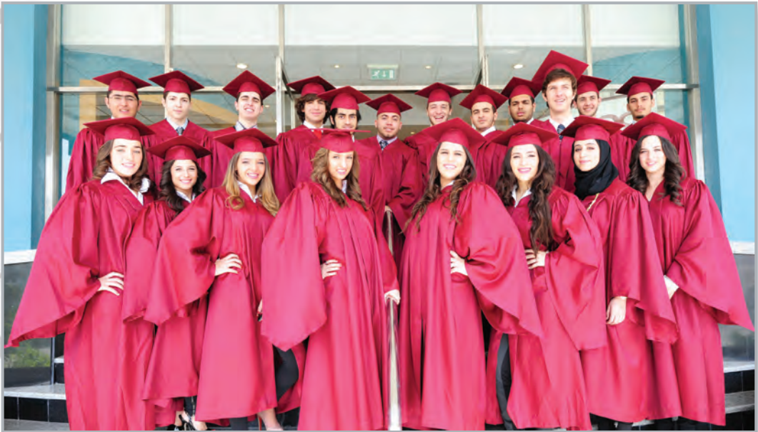
Grade 12A - ISAS