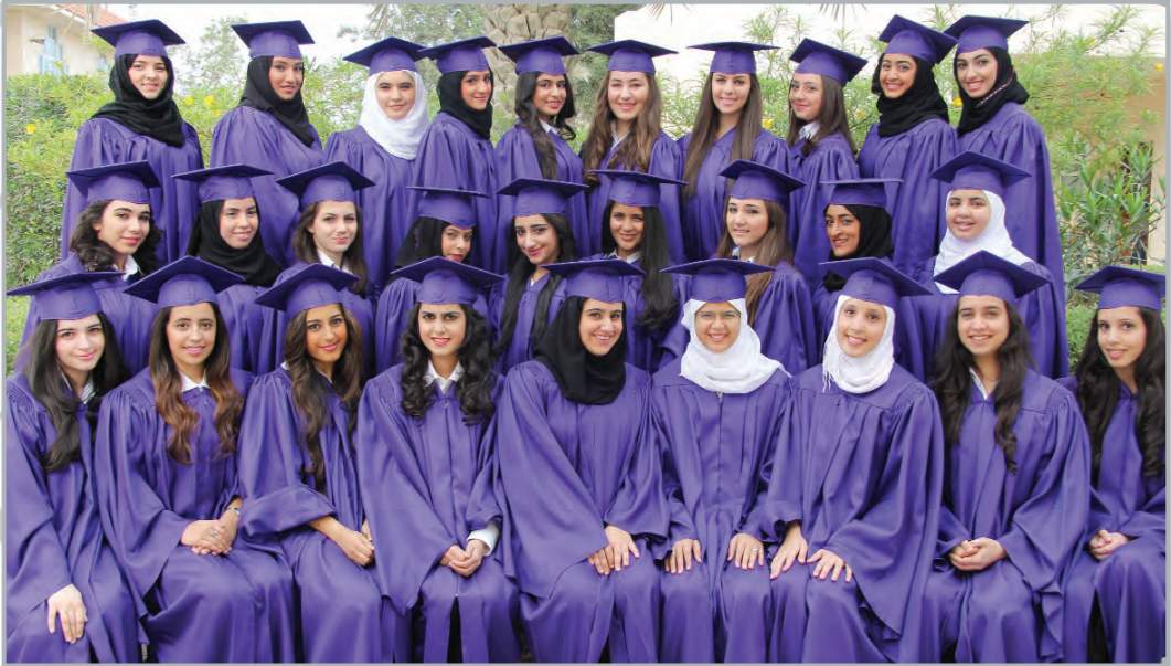
Grade 12C - Al Barsha