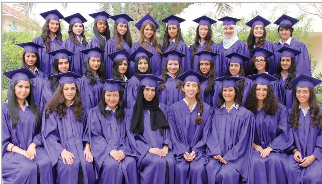
Grade 12A - Al Barsha