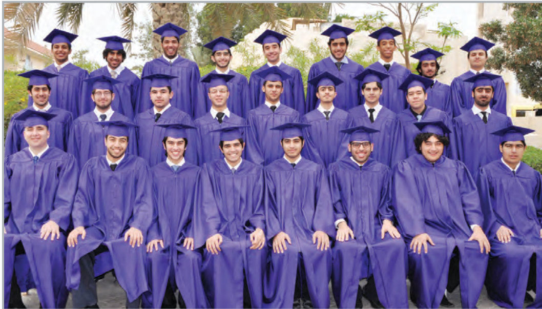
Grade 12E - Al Barsha