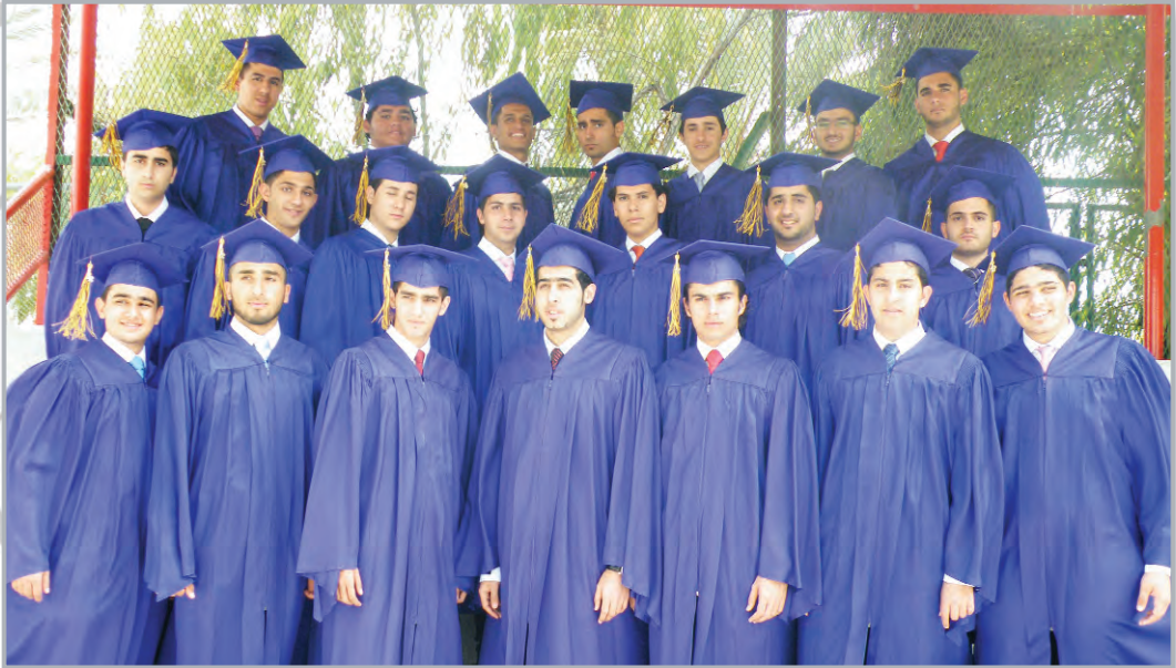
Grade 12E - Al Garhoud