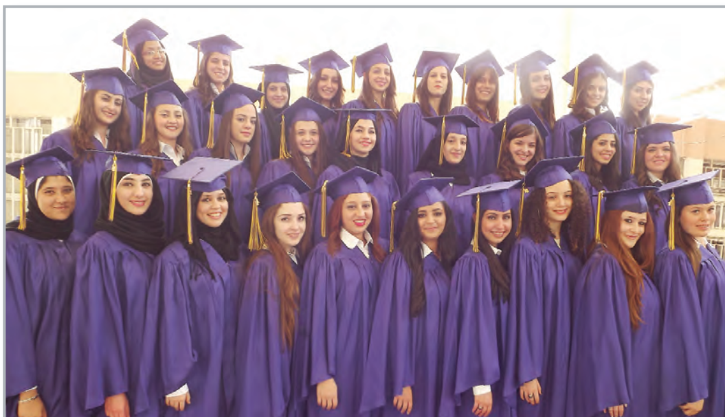
Grade 12C -Al Garhoud