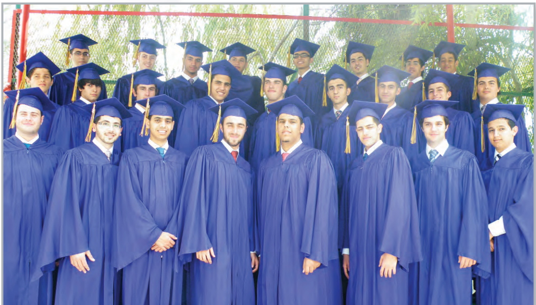
Grade 12B - Al Garhoud