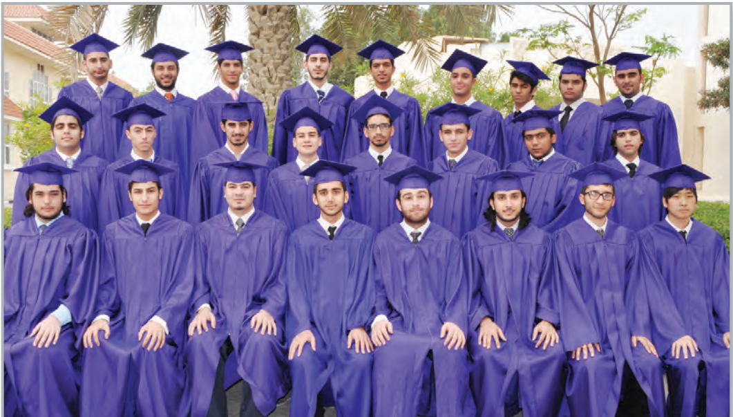
Grade 12D - Al Barsha