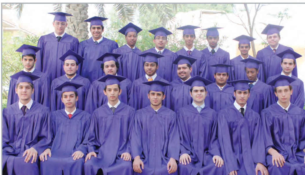
Grade 12B - Al Barsha