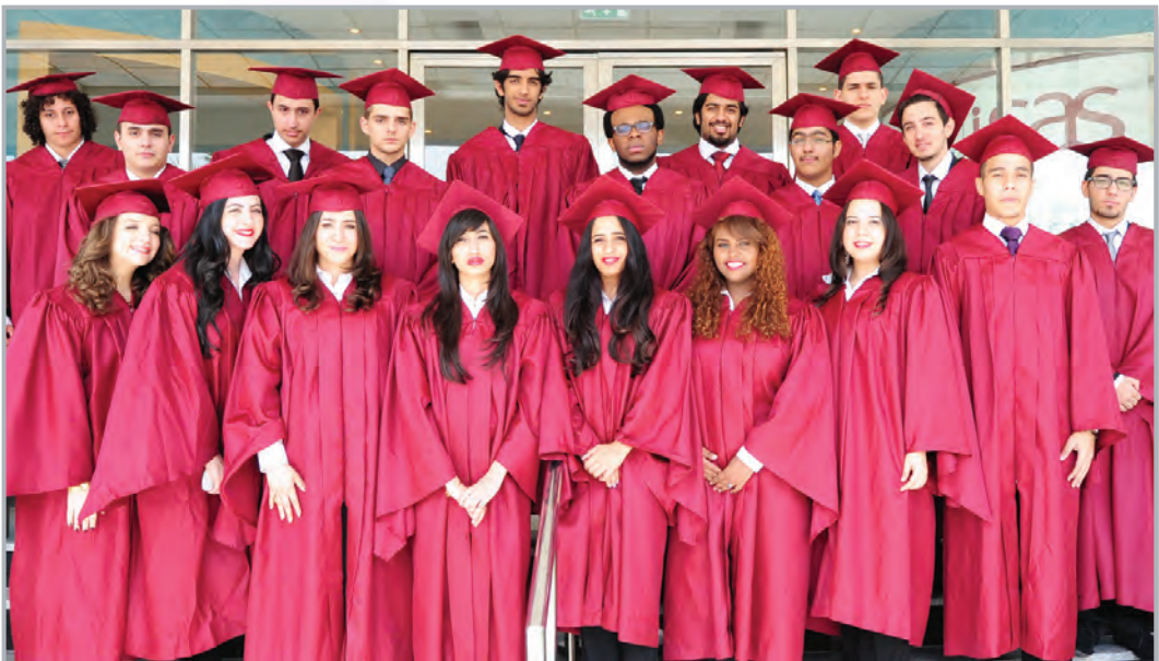
Grade 12B - ISAS